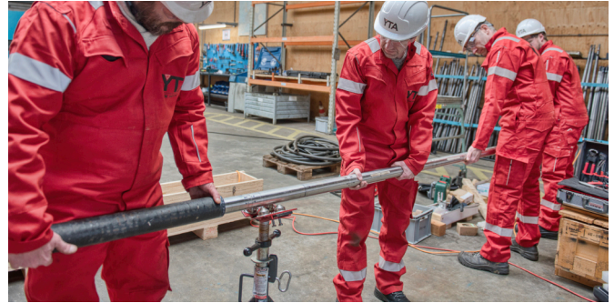
YTA team testing TCT®