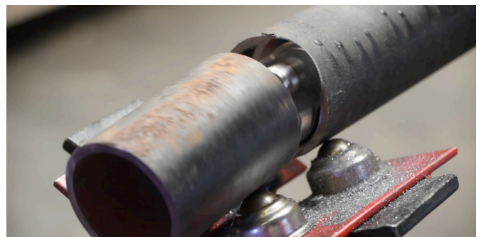
TCT® horizontal cutting result